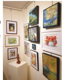
ASCC Members' Show