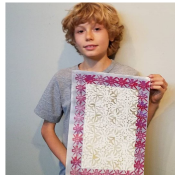
Student in ASCC's free Art in the Library program, Philmont Library. Volunteers prepared all of the supplies for this print-making workshop.

See our website for more information and other times and projects. ASCC